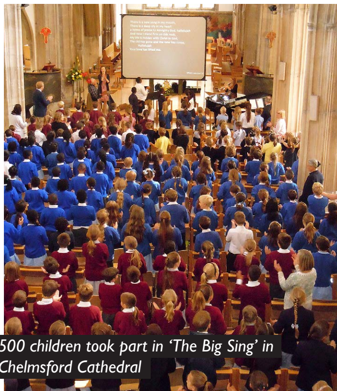
500 children took part in 'The Big Sing' in Chelmsford Cathedral

Those principles are set out in in Transforming Presence , the strategic priorities for the diocese. This remains our direction of travel together. A 'Time to Talk' consultative conference held in 2015 was attended by more than 700 people from 24 deaneries. Sub-titled 'Mapping the territory' this conference took stock of the journey from the first Time to Talk three years previously and committed to church growth with renewed purpose and vigour.