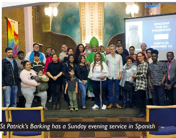
St Patrick's Barking has a Sunday evening service in Spanish