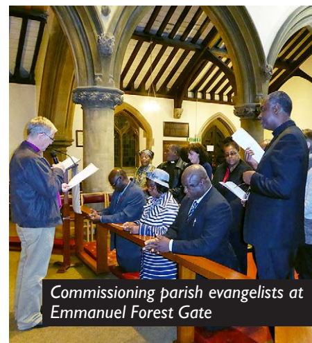
Commissioning parish evangelists at Emmanuel Forest Gate

of school leadership and being good news in schools. Our diocese became a training partner in an initiative with the Department for Education and Stonewall to combat homophobia in schools. Our Board of Education was reconstituted with a smaller membership making it more focused and strategic.