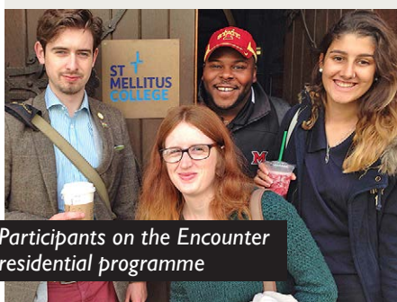
Participants on the Encounter residential programme

Our partner theological college, St Mellitus , has experienced substantial growth since it was founded in 2007. A pioneer in the use of distance learning in the Church, the college has grown its student numbers from 28 to 438. The College is training 27 of our students for ordained ministry and 24 students for licensed lay ministry. The overall decrease in stipendiary clergy due to retirements will start to be reversed in 10 years if the number of ordinands can keep on growing.