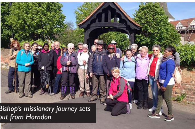
Bishop's missionary journey sets out from Horndon

The regular income of Parochial Church Councils rose from about £28.9 M in 2013 to £29.86 M in 2014 (up 3.25 per cent) with one-off income adding £12.41 M mostly for building projects. Regular expenditure was about £29.15 M, split between Share payments and running expenses, with charitable giving of about £1.5 M and capital expenditure of £10.42 M.