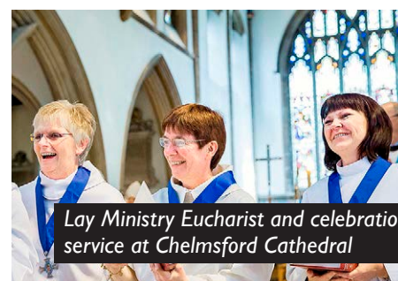
Lay Ministry Eucharist and celebration service at Chelmsford Cathedral

Our first Mission and Ministry Unit was endorsed. A 'Simple Guide to Mission & Ministry Units' is available on our Transforming Presence website. Mission and Ministry Units are our way of ensuring every community is served, resources are deployed strategically and there is room for incentive and growth. Groups of parishes looking to form a Mission and Ministry Unit may now bid for grant funding for a project or activity on which they are working together.