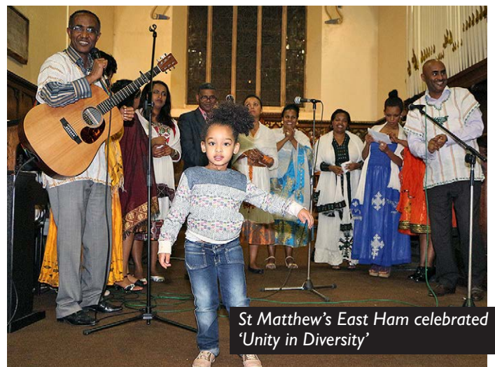
St Matthew's East Ham celebrated 'Unity in Diversity'

Many additional improvements and achievements were made. New models of LLM training and the Clergy Leadership Programme were offered and plans were made for a new model of incumbency and priesthood. 279