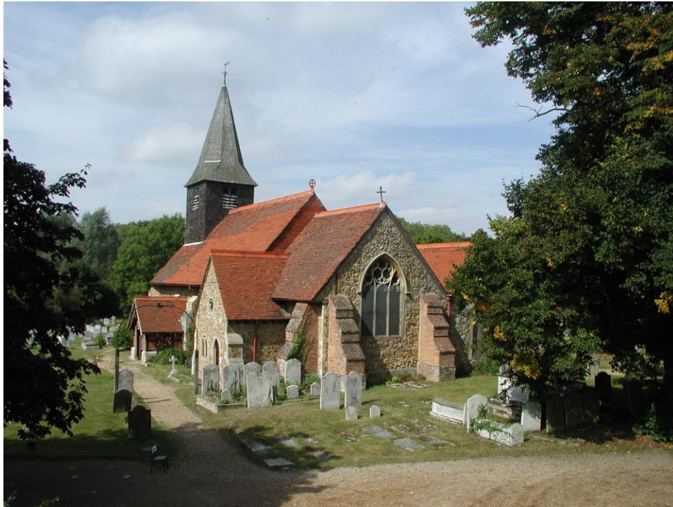
Exterior of the church from the south-east