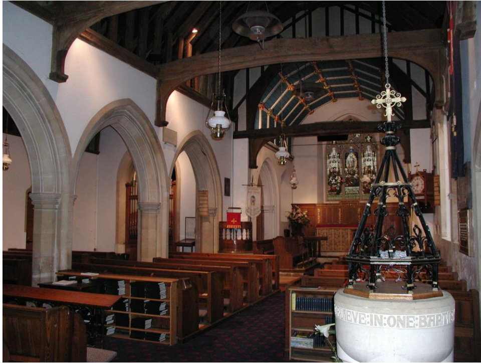
Interior, looking east