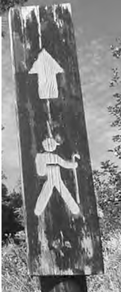
A sign on the Camino Way