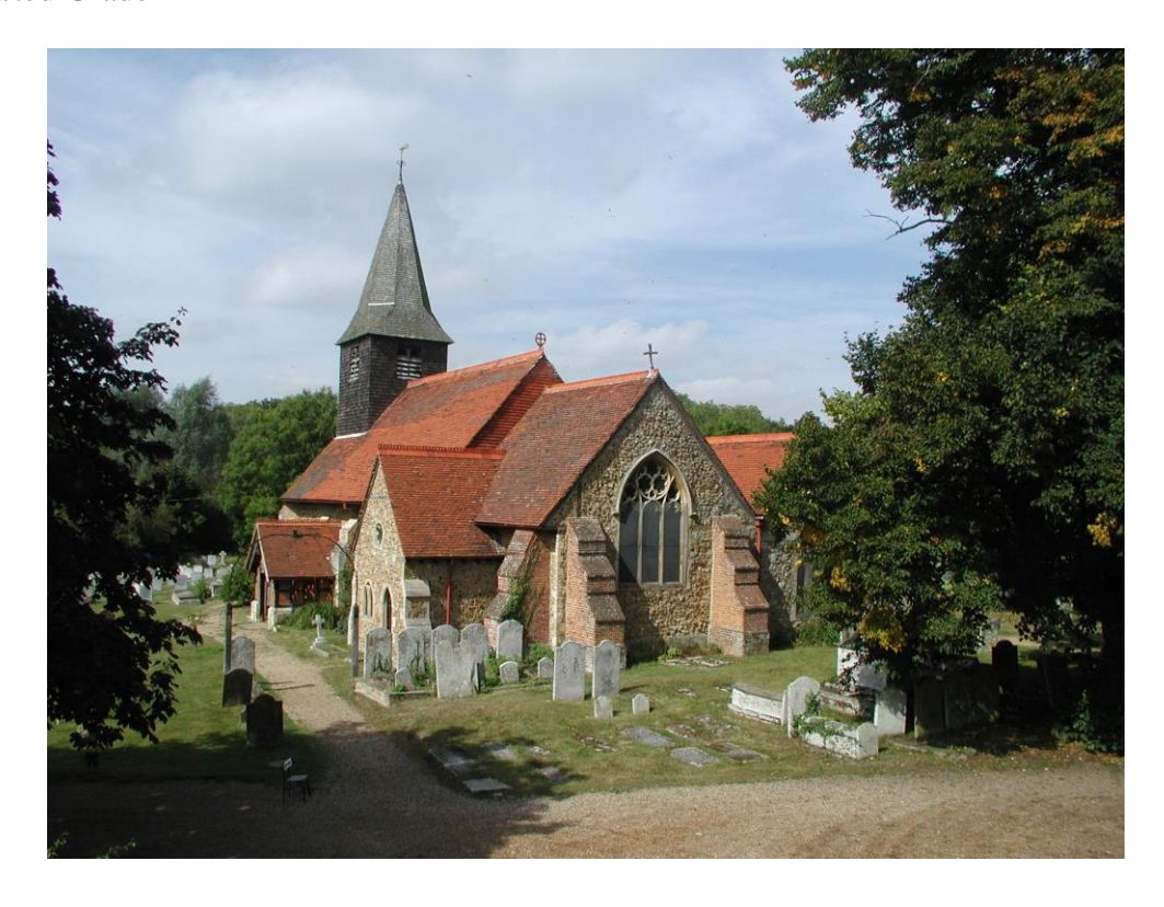
Exterior of the church from the south-east