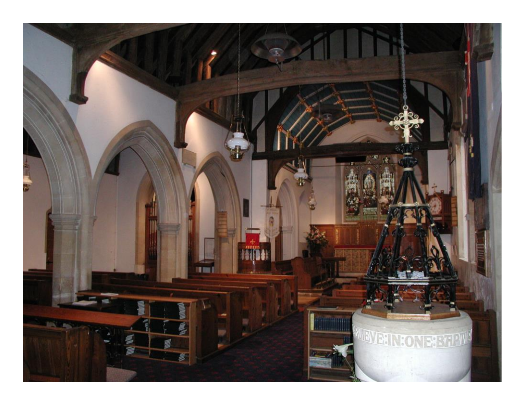
Interior, looking east