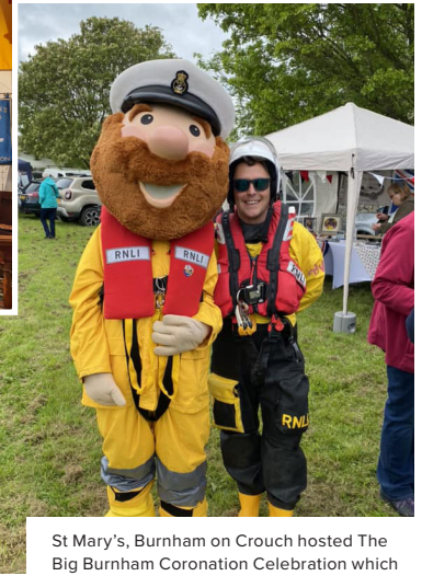
St Mary's, Burnham on Crouch hosted The Big Burnham Coronation Celebration which showcased local volunteering opportunities.