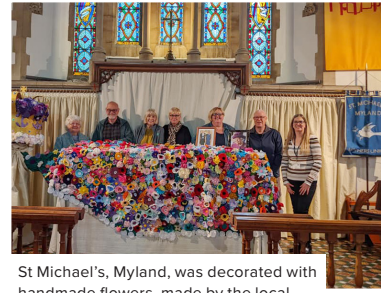
St Michael's, Myland, was decorated with handmade flowers, made by the local community in celebration of the Coronation.

Please pray for the young people who completed the Growing Young Leaders course as they continue to serve God in their church communities.