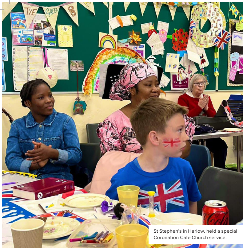
St Stephen's in Harlow, held a special Coronation Cafe Church service.