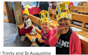
Holy Trinity and St Augustine of Hippo, Leytonstone held a Coronation Big Lunch