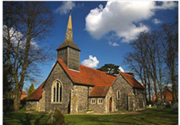
St Mary's, Stapleford Tawney

St. Mary's probably dates from the 13 th century, with important restoration work having been carried out in 1862. There is seating for about 100 people plus choir stalls. The church has an integral parish room with kitchen and toilet facilities, added in 1999. Big enough for up to 30 people, it is ideal for meetings, Lent groups and Parish Lunches, as well as post-service refreshments. It enables us to hold fund-raising talks and musical events more comfortably. The splendid 1873 Willis organ is played at organ recitals as well as for worship.