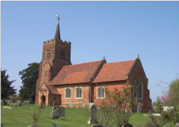
St Michael's, Theydon Mount