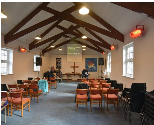
St Andrew's, Bicknacre

We can offer our prayers and support for you – and we hope you will be encouraged by hearing other ministers in the Hill and Vale Churches preach. We believe that we are called not to be communities gathered around one Minister, but ministering communities.