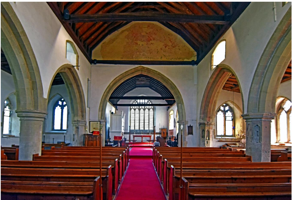
St Mary's, Woodham Ferrers