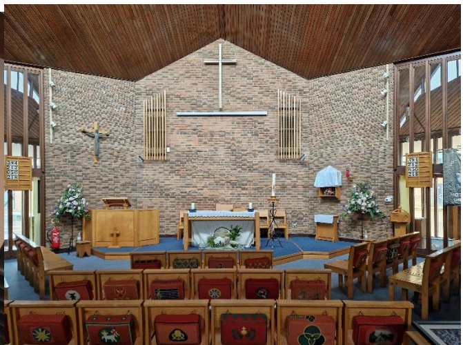
Holy Trinity, South Woodham Ferrers