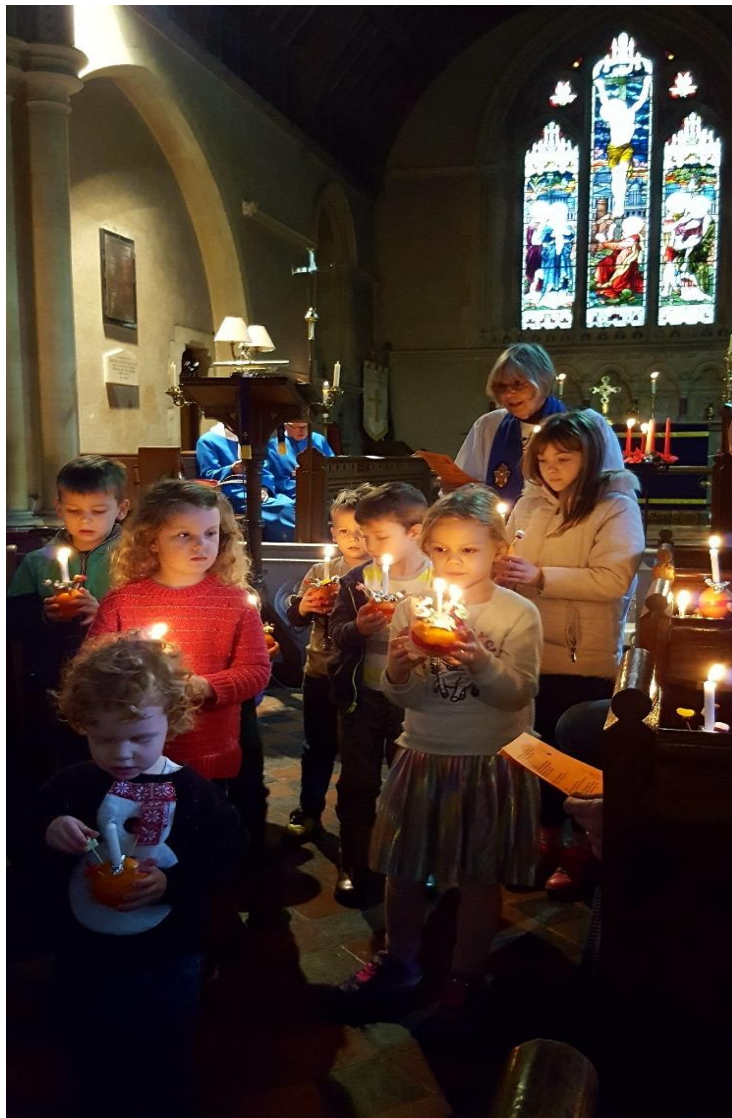
Christingle at East Hanningfield