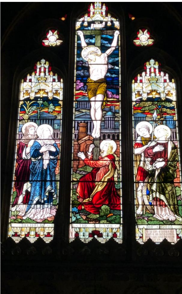
THE EAST WINDOW

As well as All Saints, there is a well-supported Bethel Evangelical Chapel. In recent years we have instigated joint carol-singing round the village with refreshments after.