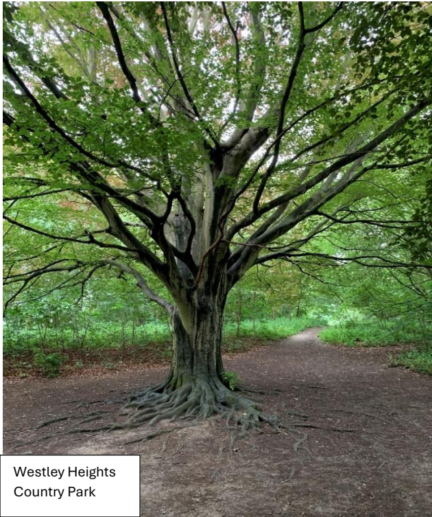
Westley Heights Country Park

possible to walk from one to the other without crossing a road or even seeing a house. On the way you can find spectacular views of the estuary out to Canary Wharf and the City.