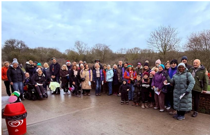
Caroling at the Langdon Nature Discovery Centre after our monthly walk. An opportunity to hand out leaflets about our church and Christmas services.