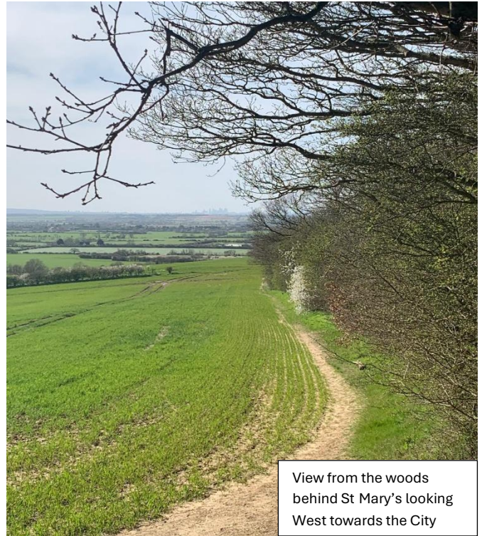
View from the woods behind St Mary's looking West towards the City

As well as the natural amenities, the parish includes recreational parks and play areas, cafes and shops including a large Tesco. Laindon railway station is a short walk from the Rectory, and a large section of the community commutes to London or Southend areas.