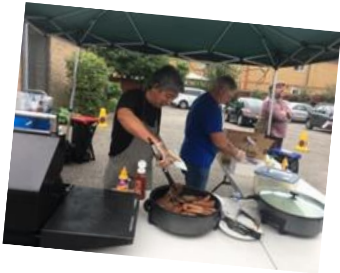
Prepping for the post Alpha BBQ celebrations with our resident chef!