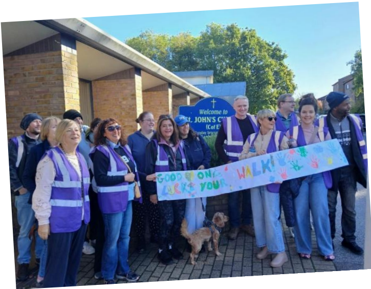
Combining our monthly community walk with the sponsored “Fun Walk” to raise funds for our churches and pre-school