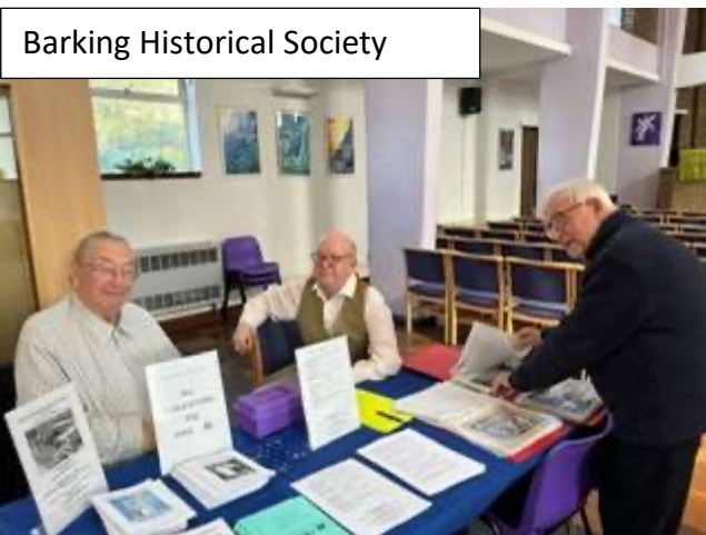
Barking Historical Society