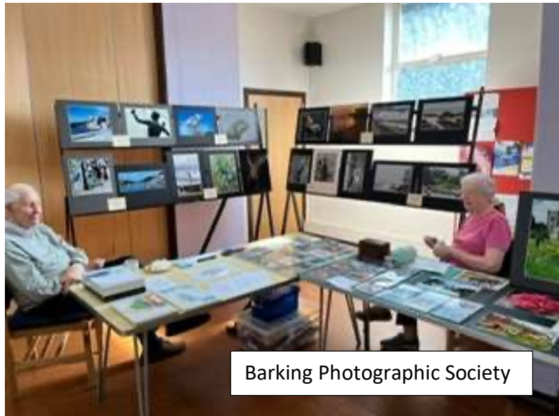
Barking Photographic Society