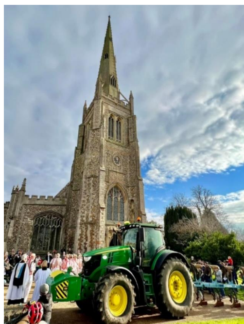
Plough Sunday at Thaxted

Thaxted Parish church has a small team of servers and a number of chalice assistants. There is a reliable team of readers, intercessors and sidespersons.