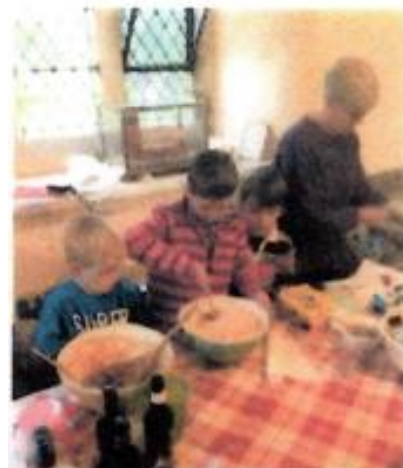
Stir Up Sunday at Hempstead

St Andrew's sits in the heart of Hempstead Village, surrounded by rural Essex countryside. The community is socially and economically diverse. Most of the younger Hempstead children go to school in Radwinter. Historically farming was the main employer in the village; today, many residents commute to work, mainly to London or Cambridge; nevertheless, farming is intrinsically linked within the local community. The village hall, which is used by various village societies, including Scouts/Cubs, Amateur Dramatic Society and for Parish Council meetings. The Glebe has a new recreation area. A monthly newsletter is emailed to residents of the village and includes news of village life and events, including church services.