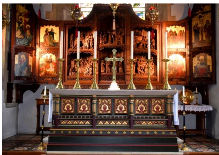
The Radwinter Reredos

The church stands in the centre of the village and is mediaeval in origin, with the nave dating from about 1250, albeit much of the church was heavily restored and enlarged in 1869-70. Some elements of the old church were kept, including the 14th century porch. Further work was undertaken later with the rebuilding of the tower and spire - there are eight bells in the tower, and the fourth and seventh are by Robert Oldfield, dated 1616. More of the original old church can be seen inside, including the 14th century nave roof. There is fine Victorian work as well, particularly the chancel screen. The reredos is what many consider to be Radwinter's greatest treasure - it is Flemish and from the early 16 th century and shows scenes from the Life of Our Lady.