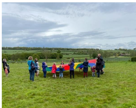
Children exploring the theme of 'Wind' at the Little Sampford Pentecost Service

There is a Village Hall, shared with the school, used for a wide variety of activities including a successful Youth Club. There are close links with the Baptist church in the village, who participate in the monthly 'Seedlings' initiative which is a group for pre-school children and their carers. The Sampfords has a long-established Cricket Club which celebrated its Bicentenary in the 1980s and is now the owner of the freehold to its ground and the recently built pavilion.