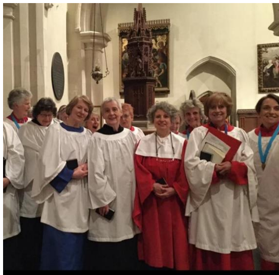
The Sampford Singers

There is no choir for the Village churches, but on major festivals the Villages singing is led by the Sampford Singers, a non-Church group of largely Church members, who support at least one Sung Eucharist each month. There are organists who regularly play in each Church and other musicians help out when required.