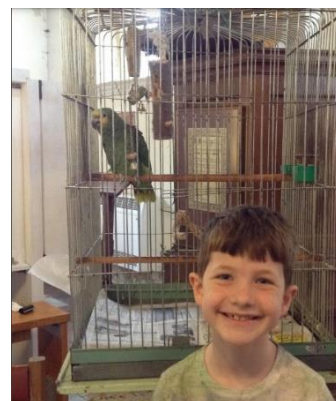
The Pet Service at Great Sampford

In common with many churches across the country, all the Parishes have seen a reduction in attendees since the COVID-19 pandemic. Whilst we have seen some recovery recently, there is still much to do to recover fully and then grow our church attendances.