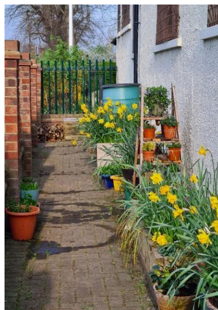
Right: Eco Church Garden alongside St Mary's Hall