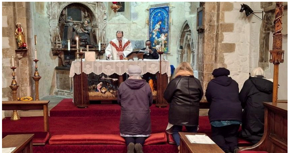
Right: Wednesday evening Mass at St Mary's

Pastoral ministry at St Mary's is the principle responsibility of the Team Rector (who was previously Team Vicar at St Mary's). There will be opportunities to share in the ministries at St Mary's as part of the Team Vicar's wider parish role, especially youth and children's ministry, links with the nature reserve and special liturgical occasions.