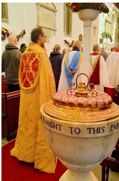
Left: Carol Service 2024 at St Mary Magdalene