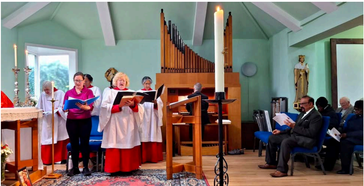
Above: St Edmund's Patronal Festival 2025 joined by members of the congregations from St Mary Magdalene's and St Bart's.